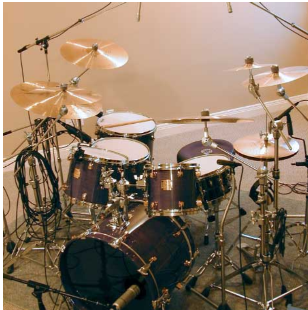
Yamaha Maple Custom (Black Maple)