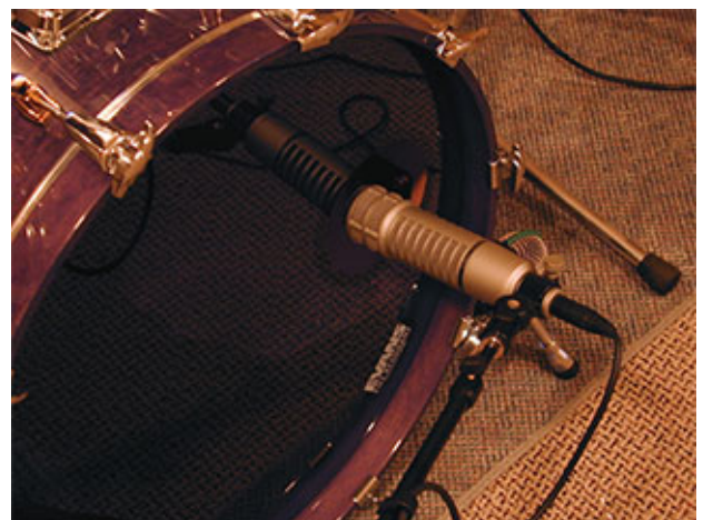
Kick Mic - Max Resonant Head Affect