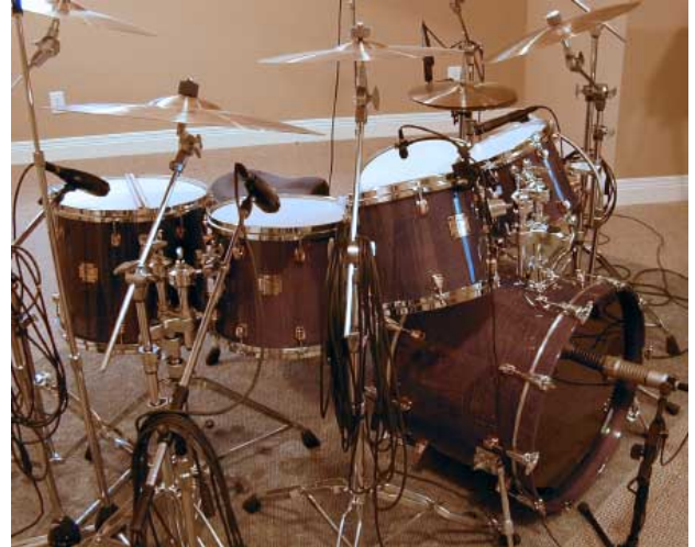
Mic Placement Shows a Typical Layout