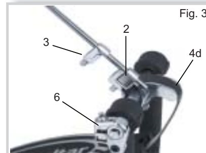
Drive Shaft Components