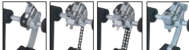
Strap Drive Single Chain Drive Double Chain Drive Direct Drive