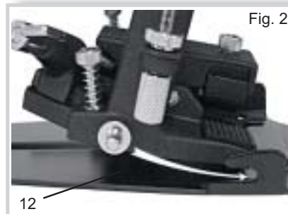
Quick Release Rock Plate