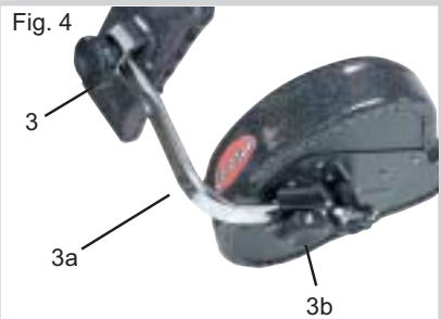
Optional Backrest Assembly