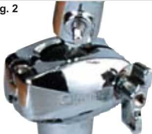
Pivot Style Ball