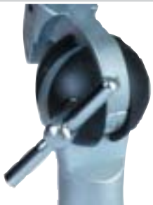
Ultra Adjust Ball