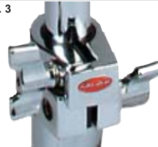
Hinged Memory lock